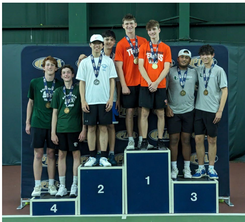
2A Boys Doubles: (left to right) Bishop Shanahan, Masterman, Cathedral Prep, Lewisburg