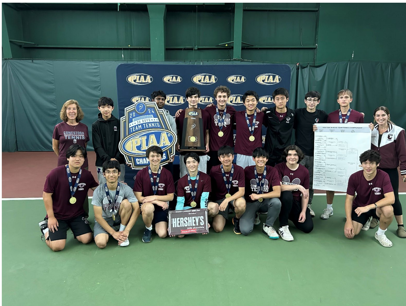
Conestoga HS wins back-to-back 3A Boys' Tennis Team Titles.

In the 2A championship, the finals were between the number one seed from District III, Lancaster Country Day HS, and the number one seed from District X, Cathedral Prep HS. Lancaster Country Day came into the Team Championships as the 2A defending champion, winning the title in 2023, making their third consecutive team final. Lancaster Country Day was 11-1 in the championship bracket.