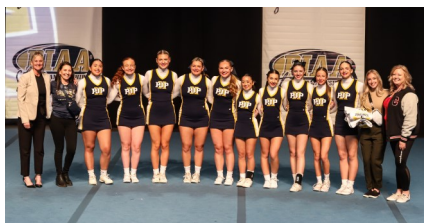
Pictured: PJP Competitive Spirit Team

This year's Champion Team Spirit Award went to Pope John Paul II HS. PJP has gone above and beyond as a cheerleading team. Each week they work with the Spring Valley YMCA supporting children with special abilities. They also collected over 38 bags of food for the Patrician Society's Emergency Food Cupboard. And through their efforts of adding breast cancer awareness to their game day routines, using the themes of "Roar for a Cure" and "Think Pink", and creating a t-shirt for purchase with the back honoring those who are fighting breast cancer, raised, in coordination with other sports' teams breast cancer initiatives, almost $13,000 dollars for The Charles A. & Betty Bott Chancer Center.